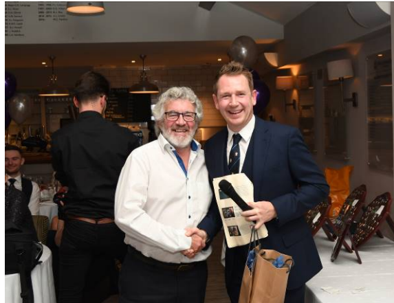
Welcoming the latest umpiring addition