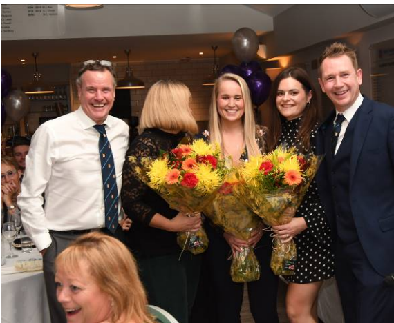
Infamous Teas Team